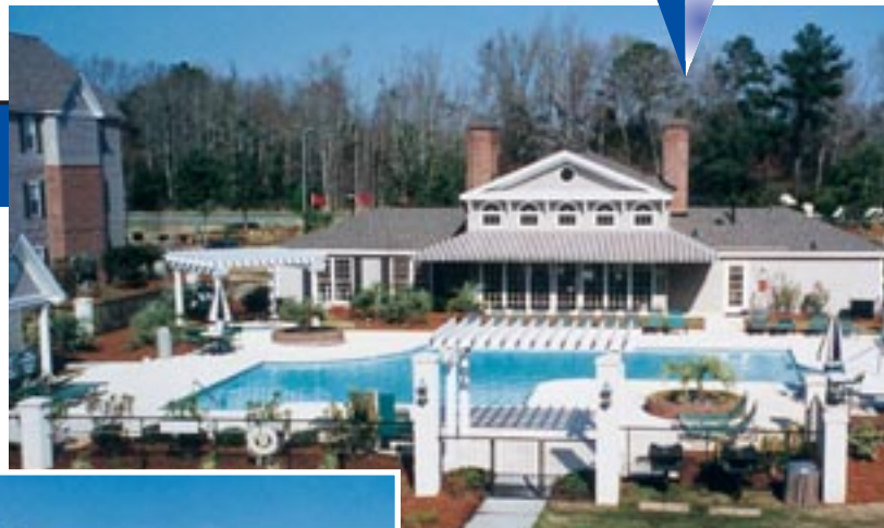
above— Georgetown Crossing Apartments, Savannah, GA