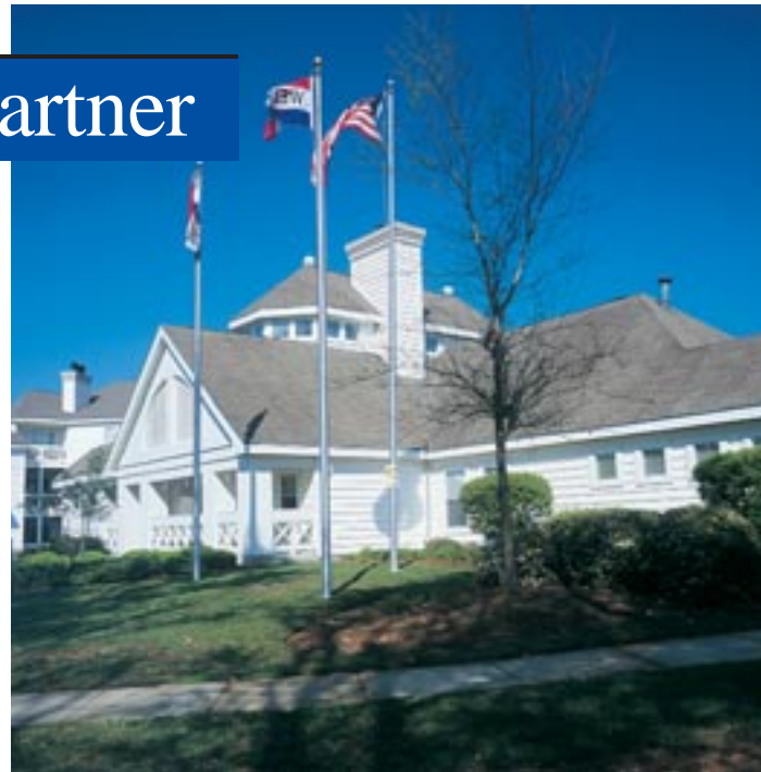
above— Cobblestone Apartments, Savannah, GA

Peace of Mind — confidence that your investment is being handled by trustworthy real estate professionals with a proven track record.