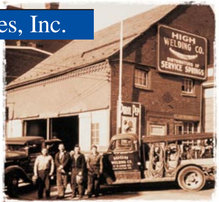
High Welding Company, the forerunner of the High Industries, Inc., started at this location in Lancaster, Pennsylvania in 1931.

The High organization began with a strong sense of quality and integrity. That position of High ethics, combined with a steadfast dedication to quality and customers, will continue to be the guiding forces behind High Industries in the future.