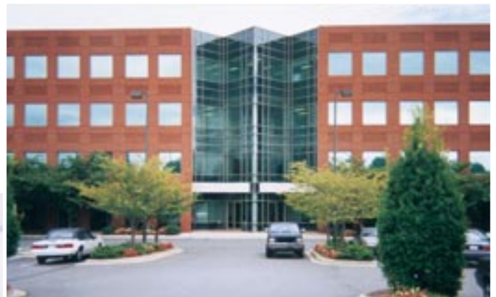
below left— Westbury Mews Apartments, Summerville, SC